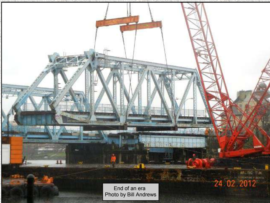
End of an era