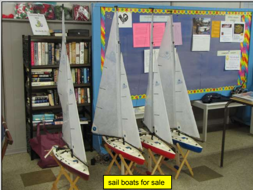
sail boats for sale