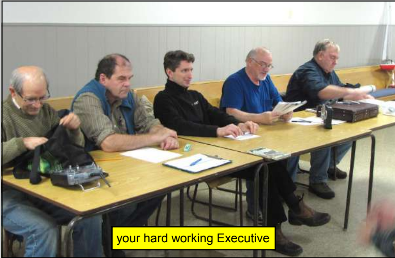
your hard working Executive