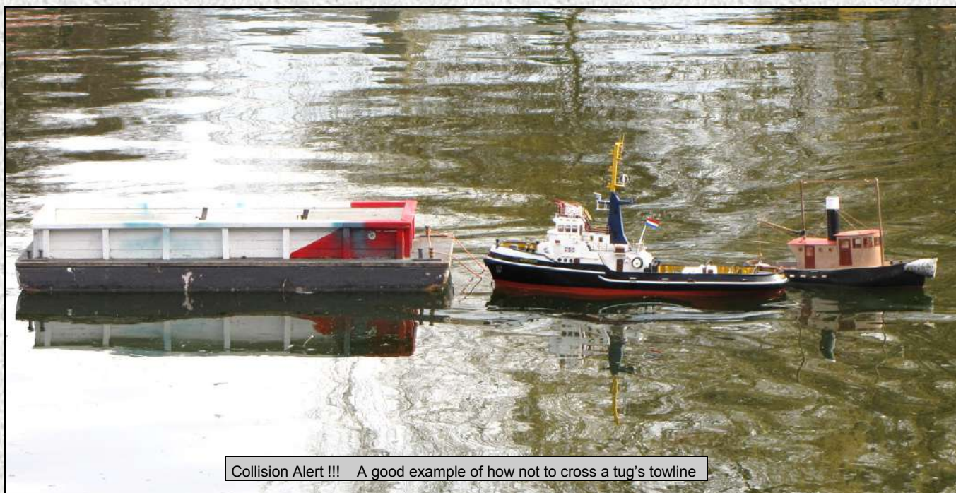
Collision Alert !!! A good example of how not to cross a tug's towline