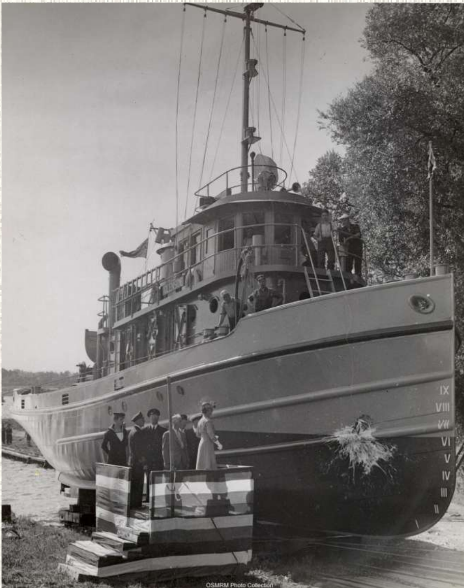
RCN Tug Glenside