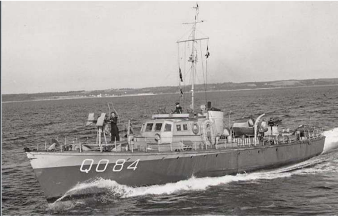
Fairmile ML084 is likely on a training exercise in St. Margaret's Bay, Nova Scotia, just west of Halifax Harbour. Each Fairmile carried around 2,500 gallons of high octane gasoline.

Vancouver Shipyard completed 6 A.C. Benson Shipyard completed 3 Star Shipyard completed 5