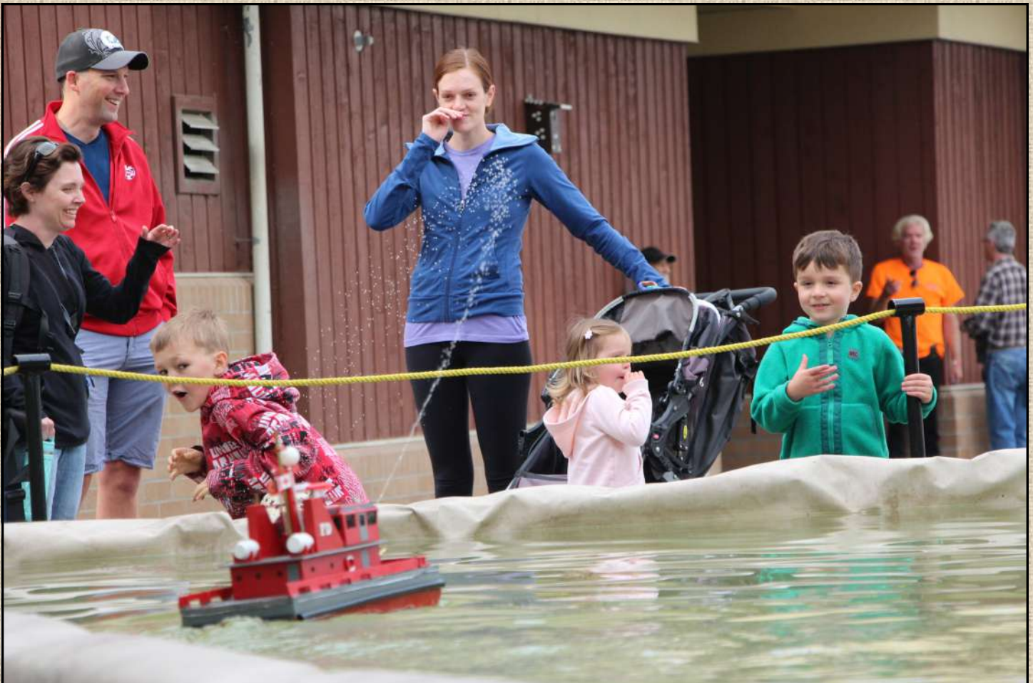
Wouldn't be a Fair without boats shooting water at passer-by's