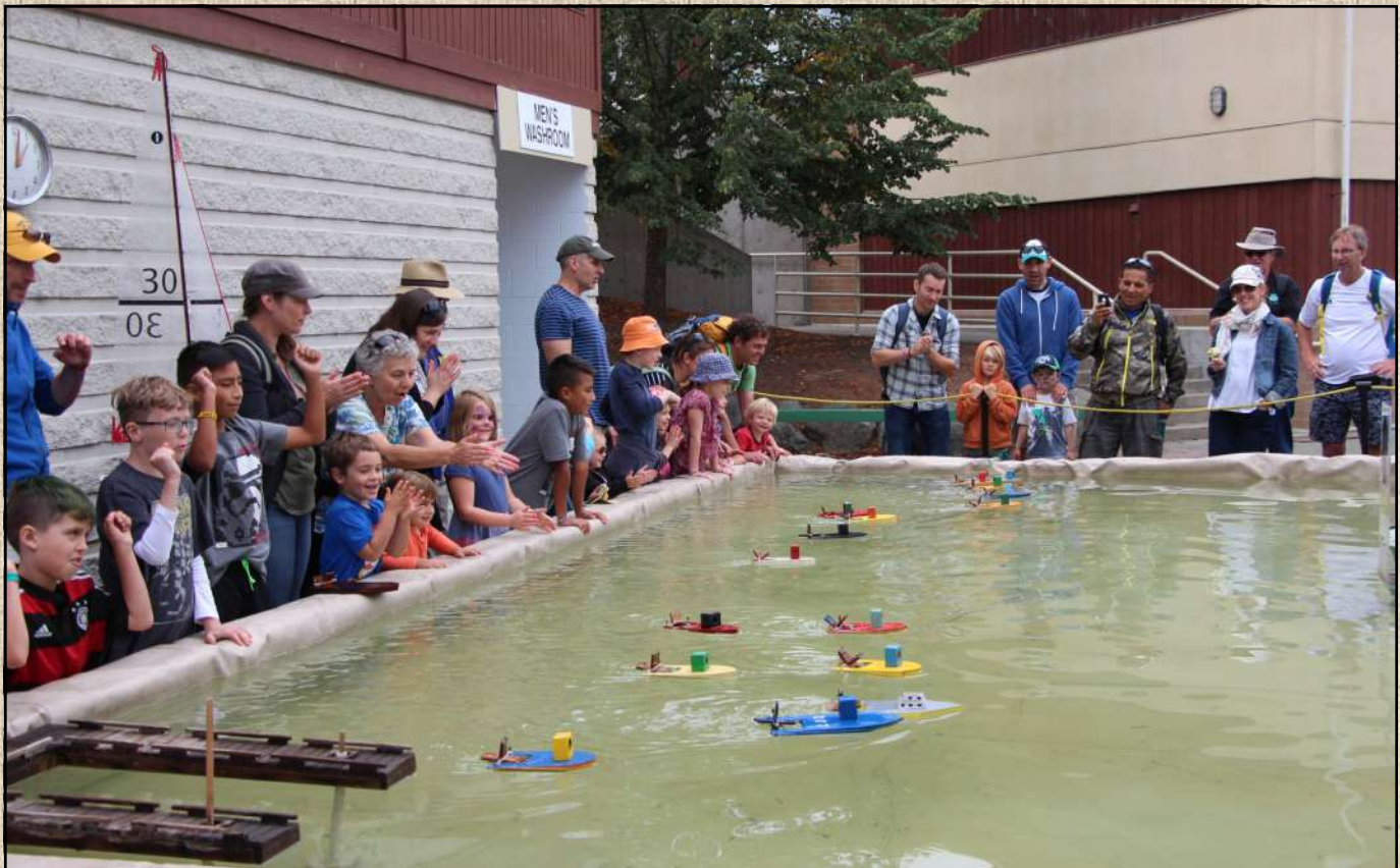
The paddle boat races are always a crowd favourite