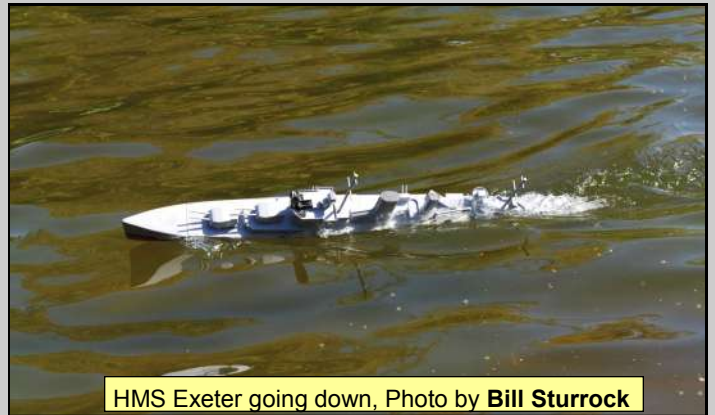
HMS Exeter going down