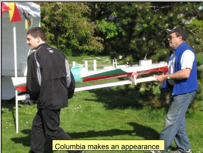
Columbia makes an appearance