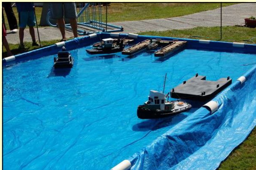
Sidney Air Museum Open House